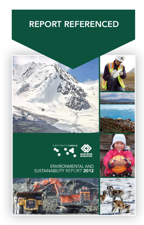
2012 ENVIRONMENT AND SUSTAINABILITY REPORT